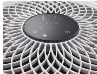
UVCA200 UV-C Floor standing air unit